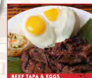
BEEF TAPA & EGGS