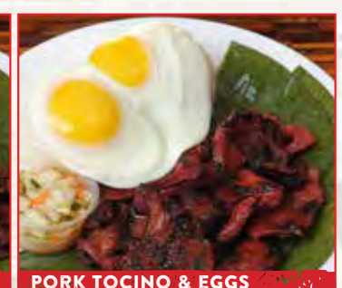
PORK TOCINO & EGGS