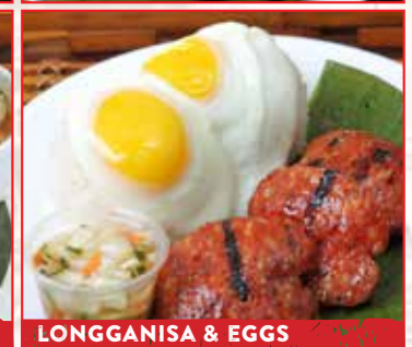
LONGGANISA & EGGS